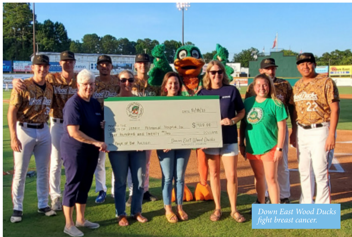
Down East Wood Ducks fight breast cancer.

Provided early detection and screening events of diseases/ disorders/risks including colorectal cancer (7), mammogram support (17), lung cancer (68) and blood pressure (4932).