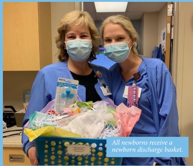
All newborns receive a newborn discharge basket.

UNC Lenoir added five new medical providers to the clinical staff in 2022. The new physicians will be practicing in our community and cover the following specialties: obstetrics and gynecology, hospital medicine, family medicine, and general surgery.